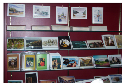
Featured Art Cards.