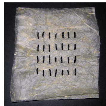
Thread Lines , Embroidered thread, gut 2012 by Elizabeth Knecht. Exhibition and featured Gift Shop Artist through December 29, 2012.