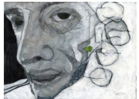
Flume-Memory painting by Rob Roys. Reverie Exhibition Opening January 4, 2013 until January 26, 2013.

In October 2012, the Museum was awarded an $8000 Alaska State Museum Grant-in-Aid to assist with a re-organization of the Museum's education collection. In a continuing effort to improve the quality of the Museum's educational programming, we will inventory, cull, and document our education collection in Past Perfect, our collection software. The grant will allow us to purchase storage cabinets and archival materials to rehouse the education collection in better and more efficient storage solutions. Our education collection is a different level of care than our permanent collection and has been established for hands-on learning and use. When this project is completed, the Museum will have taken a valuable step in reassessing its educational holdings so that we can begin to look at themes for education programs, history kits, and other educational opportunities.